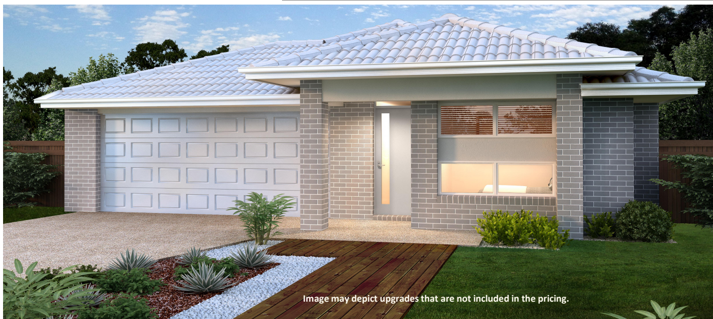
Image may depict upgrades that are not included in the pricing.

Floor area: 196.25m 2 / 21.12sq | Block Size: 512m 2